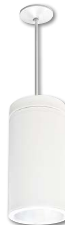
Pendant Stem Mount