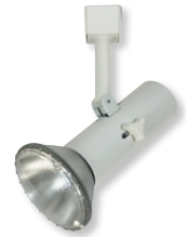
NTH-139W White Finish