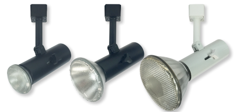
shown with PAR20