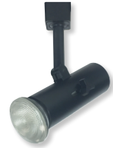
NTH-139B Black Finish