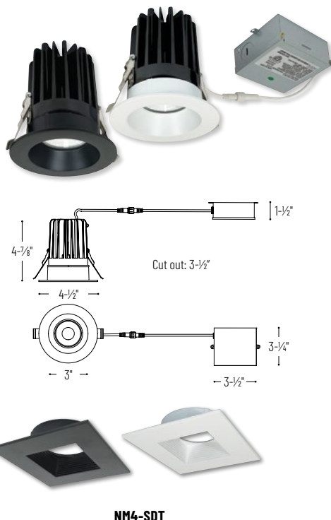
Square Baffle Trim