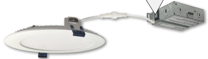
NFLAT-R6TWMPW 6" FLAT 1050lm