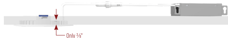
NFLAT-R4TWMPW 4" FLAT 700lm