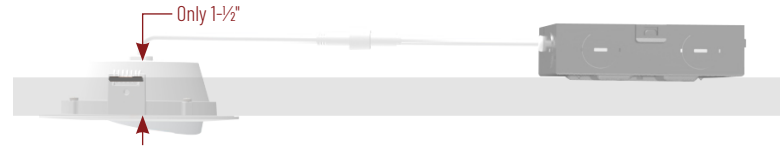
NFLINA-R4TWMPW 4" FLIN Adjustable 900lm