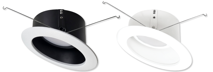
NLRS-611TWB 6" Slope Reflector Black / White

Five position sliding switch 27K / 30K / 35K / 40K / 50K