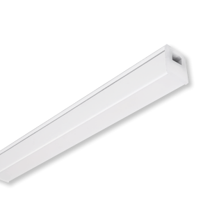
NULB120 120V LED Lightbar