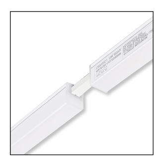
Shown with end to end connector (not installed)