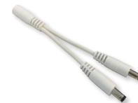
NATL-302W Power Line Splitter