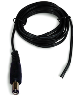
NALTL-10 / NALTL-30 Power Line Connector

24V Class 2 Dimmable Driver w/ (3) Channels (Phase, 0-10V & PWM dimming)