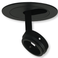
NL-490B Black Trim