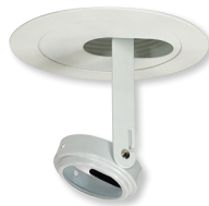
NL-490W White Trim