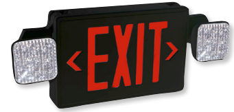
NEX-712-LED/RB Red Letters