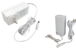
Direct Plug-In LED Driver

NATL-415W Use to join low voltage lead to low voltage power line connector or interconnector.