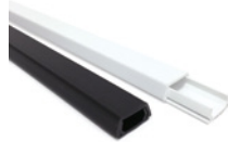
2' Wire Raceway

NMPKA-RECBZ Bronze NMPKA-RECC Chrome NMPKA-RECW White Used to mount puck light recessed and flush