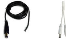
Power Line Connector

NATL-422B Black NATL-422W White Field-cutable plastic. Includes wire channel with double faced tape and cover.