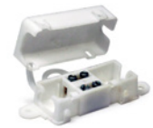
Low Voltage Splice Box

NALTL-10 10' Cable NALTL-30 30' Cable For use with Class II drivers. Carries output from driver, requires power line cable. 5" Power Line Splitter NATL-302W