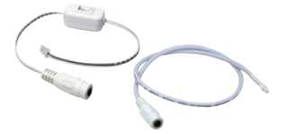
Power Line Interconnector

NAPK-713B Black NAPK-713W White Used to connect two interconnection cables together or to add interconnection cable to power line interconnector. Dim.: 3/8" W; 3/4" L; 1/4" H