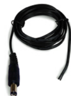
NALT-10 / NALT-30 Power Line Connector