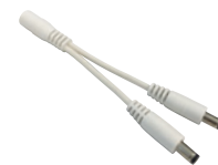
NATL-302W Power Line Splitter