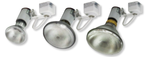
shown with PAR20