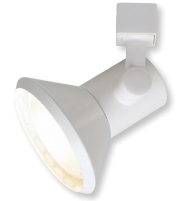
NTH-125W White Cone