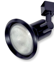
NTH-125B Black Cone