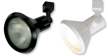
NTH-126B Black Cone