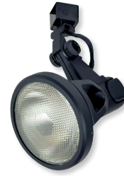
NTH-133B Black Belgium™ Front Loading Gimbal