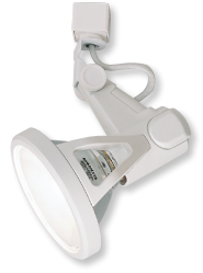
NTH-133W White Belgium™ Front Loading Gimbal