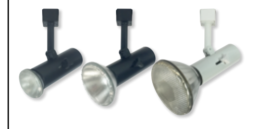
shown with PAR20