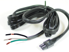
72" 3-Wire Grounded Hardwire Connector

NUA-803 Used to join two NUD-88 fixtures seamlessly together. 3-wire grounded connector. Finish: White