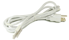
72" Cord & Plug

NUA-804B Black NUA-804W White Used to hardwire NUD-88 fixtures to NUA-802 or junction box (by others). Finish: Black or White