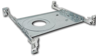
Universal New Construction Frame-In NF-R246

NFLIN-EW-4 4' NFLIN-EW-20 20' Used to extend the length between luminaire and pre-wired junction box.