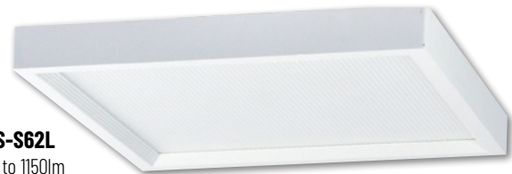
NLOS-S62L 6" / Up to 1150lm