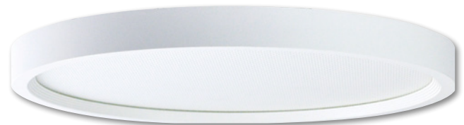
NLOS-R72L 7" / Up to 1100lm