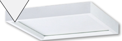
NLOS-S42L 4" / Up to 750lm