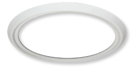
Onyx Oversize Ring

NOX-56EYELIDW White Round eyelid clips on reflector or baffle to convert into half moon wall wash