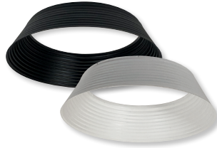
Onyx Baffle Insert

NOX-56REFLB Black NOX-56REFLD Clear Diffused NOX-56REFLH Haze Round reflector insert is field changeable used to convert the reflector finish for NOXTW-5631.