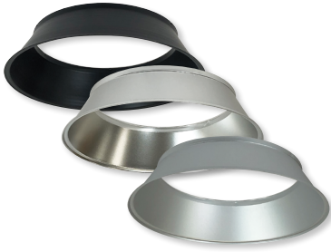
Onyx Reflector Insert

NOX-56REFLB Black NOX-56REFLD Clear Diffused NOX-56REFLH Haze Round reflector insert is field changeable used to convert the reflector finish for NOXTW-5631.