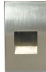
NSW-730BN Brushed Nickel