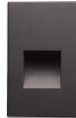
NSW-730DBZ Deep Bronze