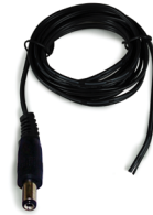
NALTL-10 / NALTL-30 Power Line Connector

24V Dimmable Class II Hardwire LED Driver MLV dimming