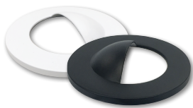
Round Wall Wash Trim for NM2-2RDC

NM2-2RPHB Matte Black NM2-2RPHMPW Matte Powder White Converts the round trim included with NM2-2RDC downlight into a round pinhole