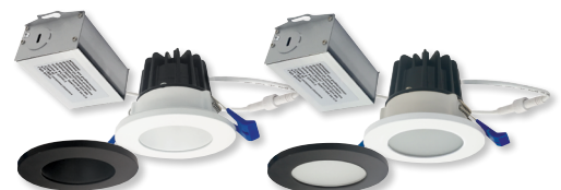
NM2-2RDC Open Downlight