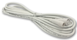
Quick Connect Extension Linkable Cables

NM2-EW-4 4' Cable NM2-EW-10 10' Cable Use to extend the length between luminaire and driver enclosure. Can be connected together to create custom lengths. Maximum length between luminaire and driver is 40'.