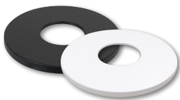
Round Pinhole Trim for NM2-2RDC

NM2-2BAFB Matte Black NM2-2BAFMPW Matte Powder White Replaces the reflector included with NM2-2RDC downlight