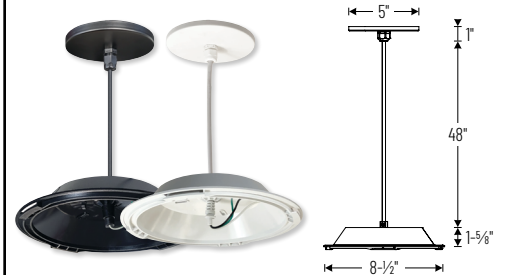
NELOCAC-16PK Pendant Kit