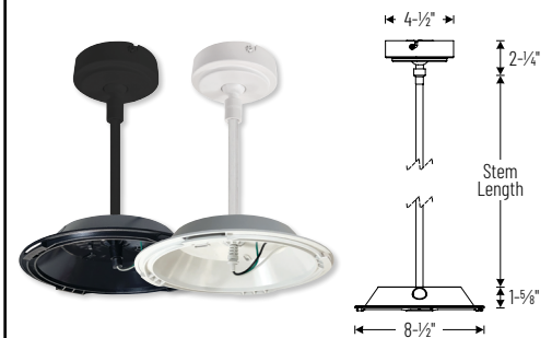
NELOCAC-16ST Stem Kit