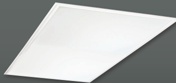
NPDBL-E LED Backlit Panels 2x2, 2x4, 1x4 · Up to 5700 Lumens