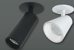
NTE-860 iPOINT LED Monopoints 1" and 2" Adjustable · 750 to 1200 Lumens