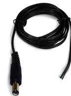
NALTL-10 / NALTL-30 Power Line Connector

24V Class 2 Dimmable Driver (Phase, 0-10V & PWM dimming)