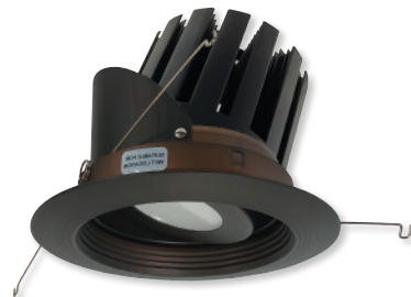
NRM3-57 5" Adjustable Regressed Baffle