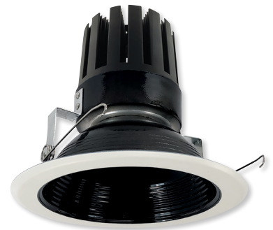
NRM3-62 6" Baffle