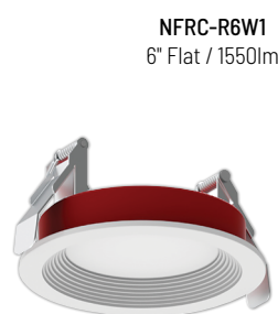
NFRC-R6W1 6" Flat / 1550lm