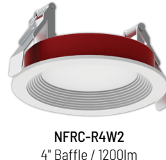
NFRC-R4W2 4" Baffle / 1200lm