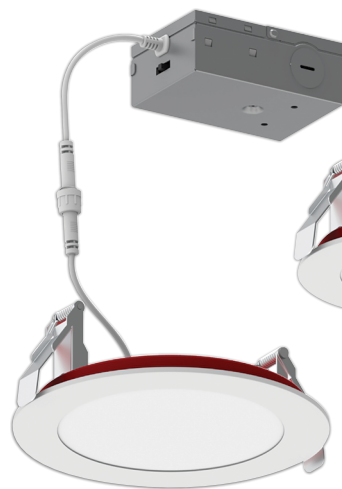
NFRC-R4W1 4" Flat / 1200lm