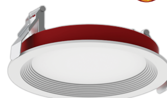
NFRC-R6W2 6" Baffle / 1500lm