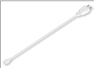
72" Cord & Plug

NUDA-HW72B Black NUDA-HW72W Matte Powder White Used to hardwire NUDA fixtures to NUA-902 or junction box (by others).