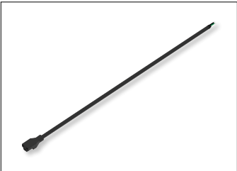
72" 3-Wire Hardwire Power Cord

NUA-902B Black NUA-902W Matte Powder White Used to power (2) NUDA fixtures using hardwire cords (NUDA-HW).