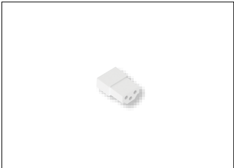
End to End Connector

NUDA-CP72B Black NUDA-CP72W Matte Powder White Used to connect NUDA fixtures to three-prong outlet.